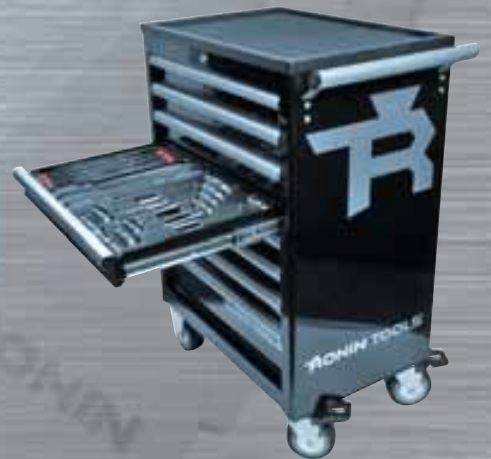
The specially developed tool station with eight drawers, including a central locking system.