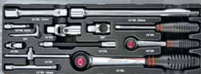
Inlay system for the tool station to quickly find the right tools for the right job.